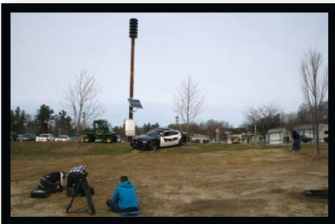
Outside picture of items being featured