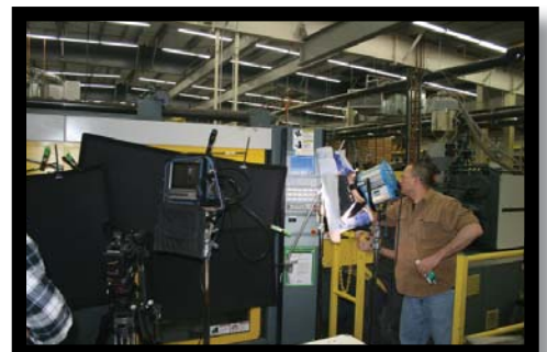
Filming of the injection molding process