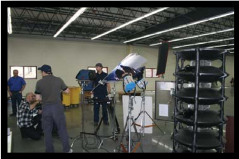
Film crew filming the control panel cabinet and 5 cell speaker