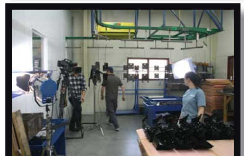
Jessica Lyles is removing speaker brackets from the powder coat line