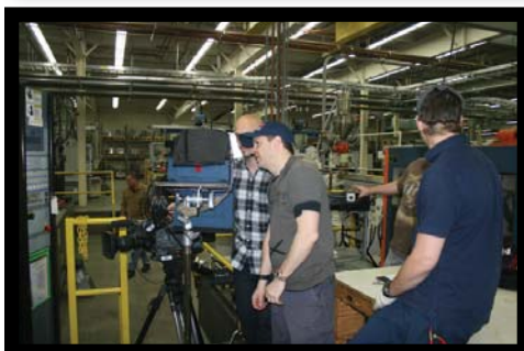
Crew filming the molding process