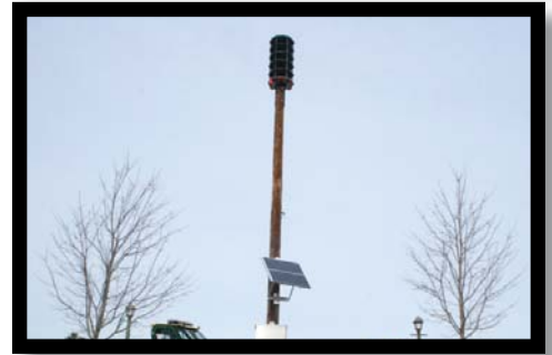
Close-up of Mass Notification Speaker and solar panel

If you're not buying WHELEN IN AMERICA You're not buying a product "Manufactured in America!"