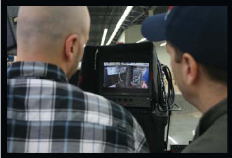
Film crew viewing a sheet of stainless steel being punched and laser cut