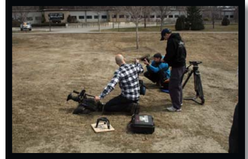
Film crew getting ready to film outside