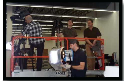
Film crew on lift to be positioned over the Bend Master cage