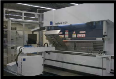
Mass Notification cabinets being bent into shape by a robotic arm