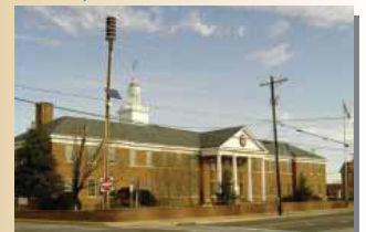
La Plata, Maryland