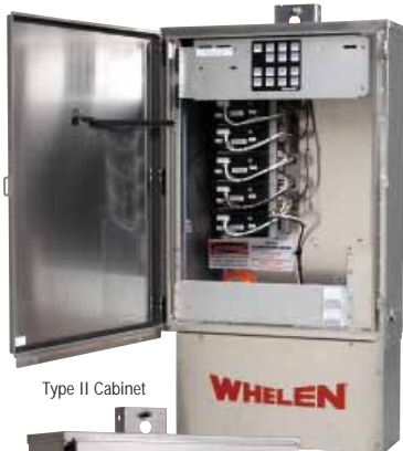
Type II Cabinet