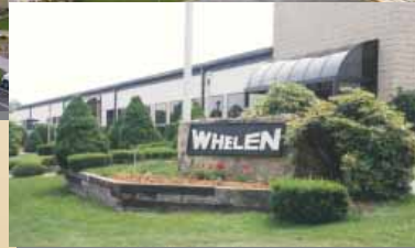
Whelen Engineering's Chester, Connecticut Facility

All Whelen products are made in the U.S.A. for use worldwide. We design and manufacture our systems at our plants in Chester, Connecticut and Charlestown, New Hampshire.