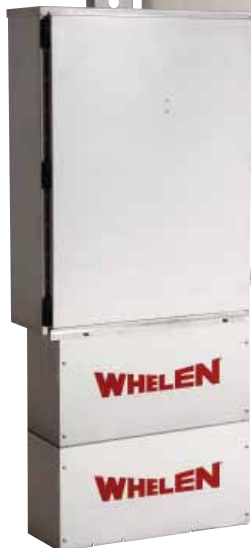
Type III Cabinet