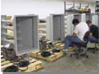
4000 Series Speakers Assembly