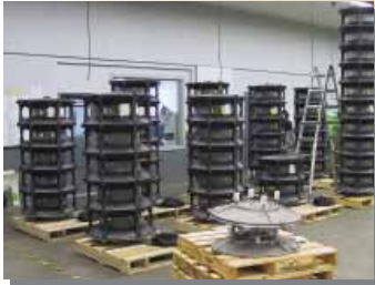
2900 Series Speakers Assembly