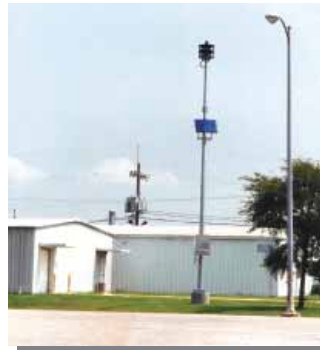
Whelen Mass Notification Product with Solar Regulator in the field.

For use when AC power is not available, Whelen's solar regulator works with appropriately sized arrays of solar panels to maintain and replenish the remote station's battery supply. The solar regulator is temperature compensated to provide optimum charging in all temperature conditions.