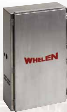
Type I Cabinet

Both types of supervision can be mixed in the same system.