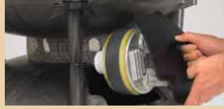
as driver clears cell housing...