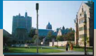
Campus / Student Alert

"For 30 years our Mass Notification Products have been voice-capable & able to operate in the absence of AC power".