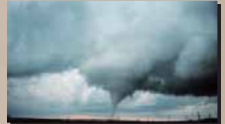
Tornado/Severe Weather Warning