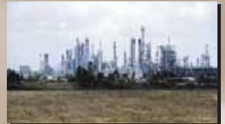
Chemical / Industrial Facilities