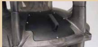
The handle grip on removable driver...