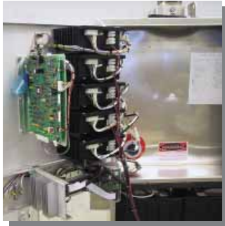
Type II Electronics Assembly detail.

Field proven tough and reliable, Whelen's reputation for excellence, reliability, power, tone and voice clarity begins with its electronics. Electronics are mounted on swing-out panels inside the electronics compartment. All modules can be tested while they are on-line and working together as a system.