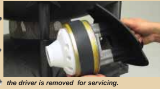
the driver is removed for servicing.