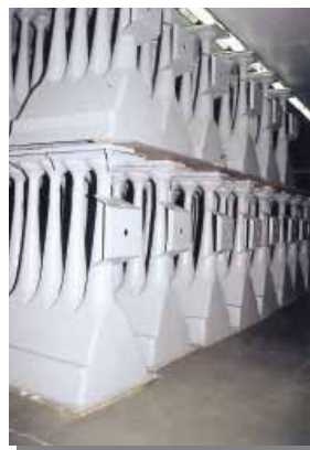
Vortex™ and WPS4000 Series speaker arrays conform to very rigid & exact quality specifications.

Standing tall and vigilant, a Whelen WPS2905 Series 5 cell speaker array on duty 24/7 for warning protection from any hazardous situation that may suddenly arise.