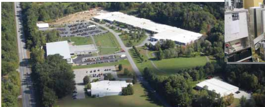
Whelen Engineering's Charlestown, New Hampshire Facility

in the most reliable, most up-to-date warning products and the service that comes with them, give us a call. Find out why Whelen Engineering is the first name in Mass Notification.