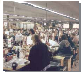
Our electronics assembly area is staffed with the most dedicated professionals in the industry.

Whelen's Remote Station Digital Voice Module, RDVM, delivers distortion-free voice messages that are pre-recorded at the factory and optimized for power and clarity. Up to 16 variable length messages of 240 or 480 seconds may be stored on the RDVM board.