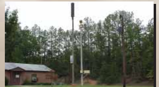
Community Firehouse Alert