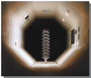
Our products are wind tunnel tested to insure performance in the most trying conditions.

Whelen's Electronic Controller maintains precision control of the remote station, including tone generation, event timing and overseeing remote station operation.