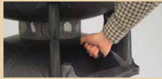
With a firm hand grip, to ease out the driver ...