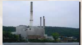
Nuclear Plant Protection